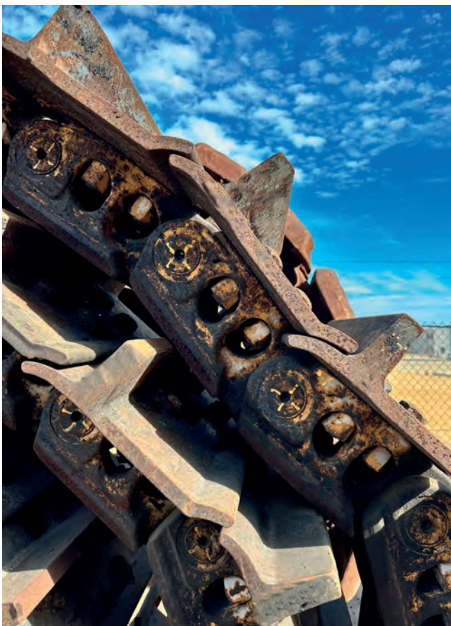
Figure 1. The undercarriage must be able to operate and perform a large dozer with a weight of up to 110 000 kg, where downtime is often simply not taken into account.

Track shoes come in various sizes and configurations to fit different types and sizes of tracked machinery. Larger track shoes are often used in mining equipment to distribute weight and reduce ground pressure, which helps prevent machinery sinking into soft ground.