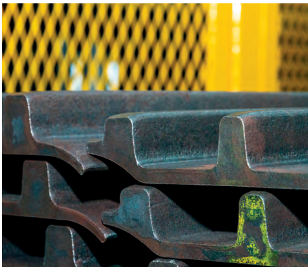
Figure 3. The profiles can have different shapes and thicknesses for perfect field application.

undercarriage failure can result in accidents, injuries, or even fatalities. By maintaining the integrity and performance of the undercarriage, mining companies can create safer working environments for their employees.